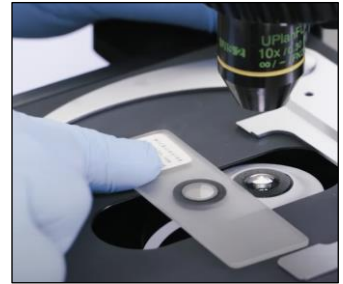
Step 2 – stage micrometer