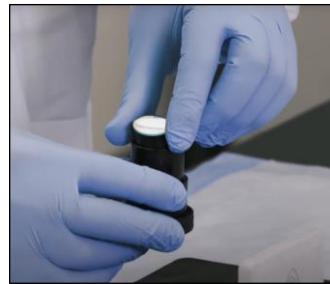
Step 1 – ocular micrometer